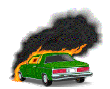
One vehicle fire was reported every 122 seconds.